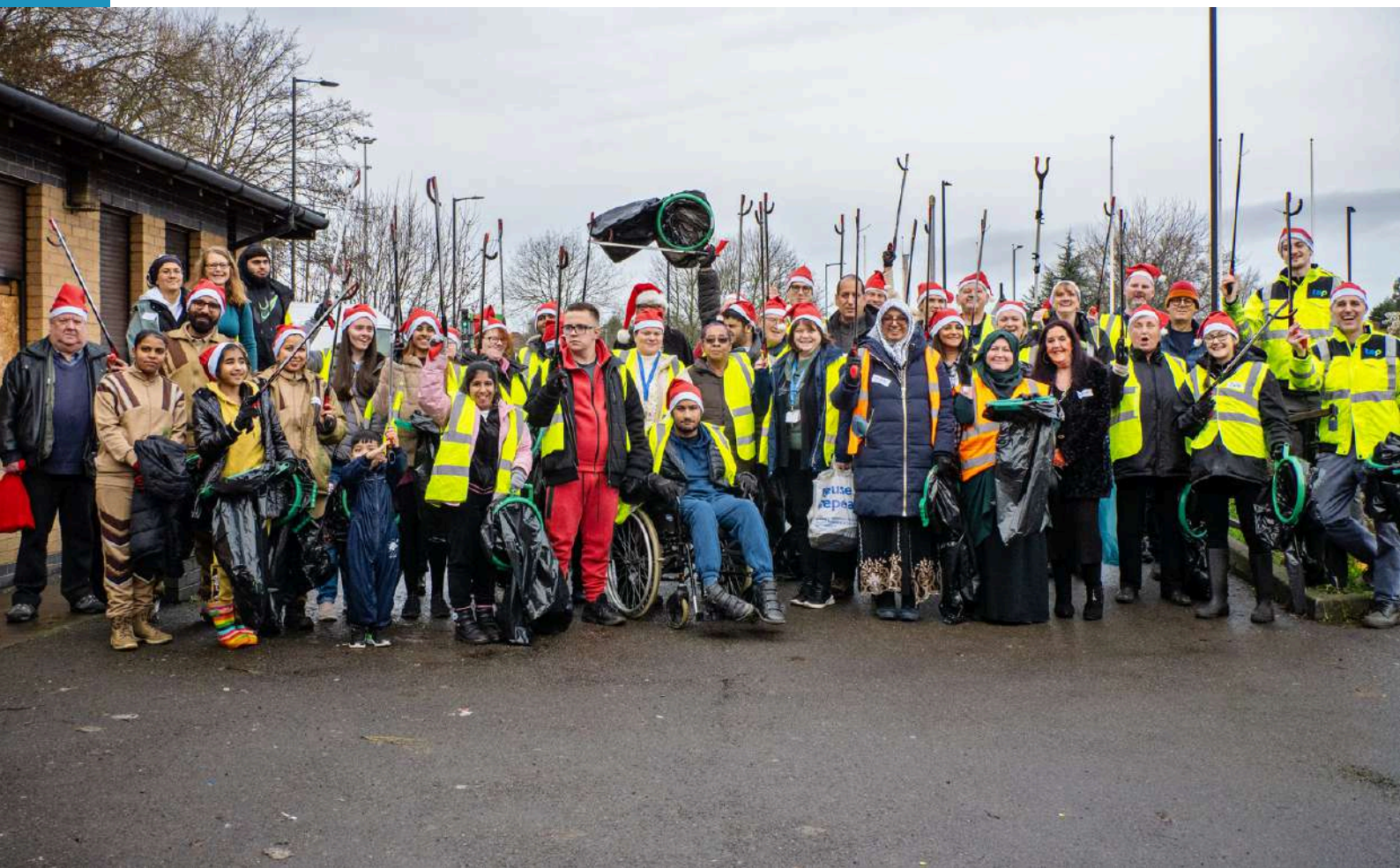
Community litter picking and mapping session